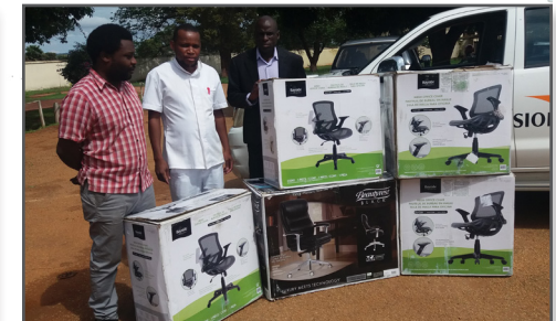
Redefining the meaning of "normal" for a clinic in Zambia