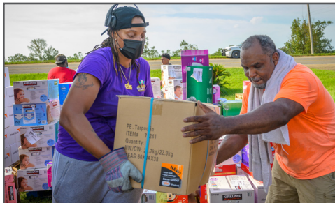
Responding to those in need after Hurricane Ida made landfall