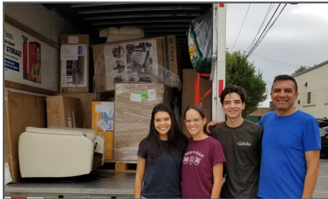
A family reunited and a house becomes a home