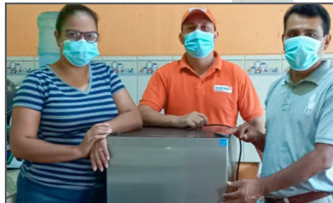
Refrigerators sent to Nicaragua