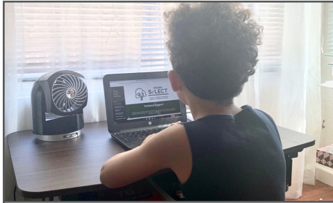
A space 100% for him to learn and grow