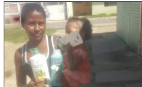
Essential hygiene products help families in Venezuela