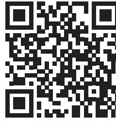
Tutorial: Connecting 2 Segments