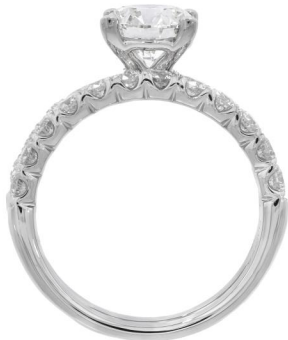
Photographs of jewelry style. Images not actual size. *Gram weights may change after final polishing or resizing.