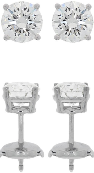
Photographs of jewelry style. Images not actual size. *Gram weights may change after final polishing.

One (1) Pair of 950 Platinum Ear Studs containing two (2) Round Brilliant Cut Diamonds weighing a total of 2.12 carats. The studs have posts with locking clutch backs and weigh a total of 3.57 grams.