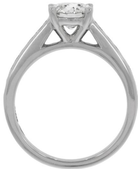
Photographs of jewelry style. Images not actual size. *Gram weights may change after final polishing or resizing.