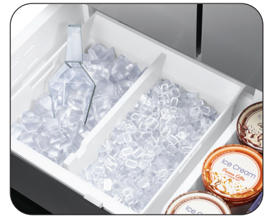
Dual Auto Ice Maker