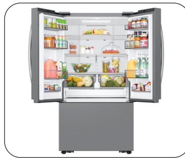
Large 27 cu. ft. Capacity