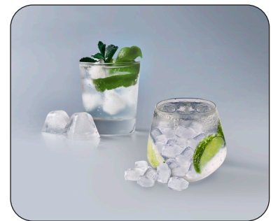
Dual Ice Maker with Ice Bites